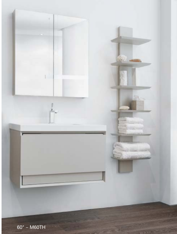
60" - M60TH