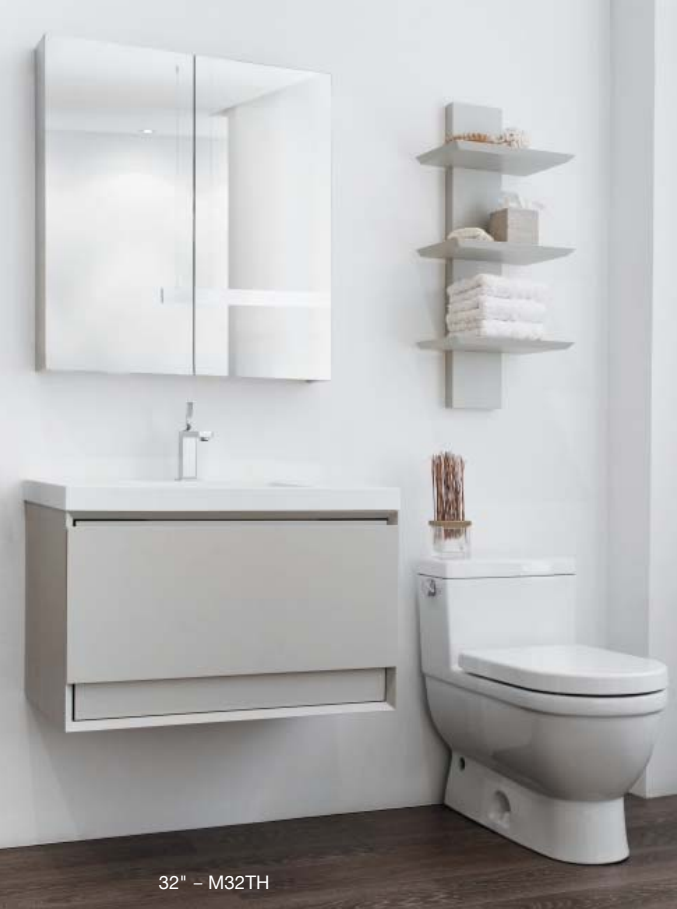
32" - M32TH