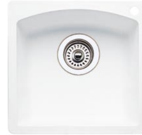
MODEL 511-636 Shown